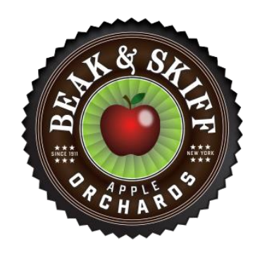
Beak and Skiff Apple Orchards and 1911 hard ciders