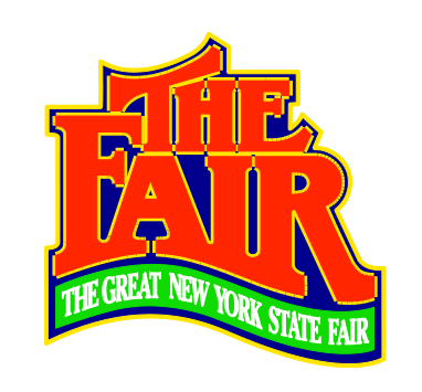
The New York State Fair