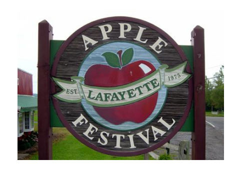
The Layfayette Apple Festival